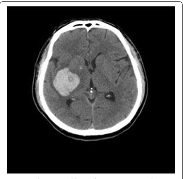
Figure 1 Right putaminal hemorrhage in a patient with poststroke mania.

His consciousness level was clear. The findings on his electroencephalogram were normal. Clinical neuropsychological tests were performed during the manic state. The patient's full-scale intelligence quotient (FIQ) on the Wechsler Adult Intelligence Scale III was 102