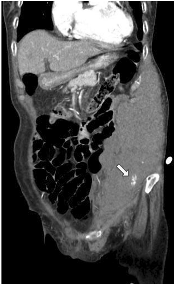
Figure 1 Abdominal CT with contrast showing a large hematoma and contrast extravasation (arrow) in abdomen.

thrombectomy via the Penumbra catheter was performed with manual suction. After successful recanalization with this procedure, the patient's symptoms dramatically improved: the NIHSS score improved to 3 points.