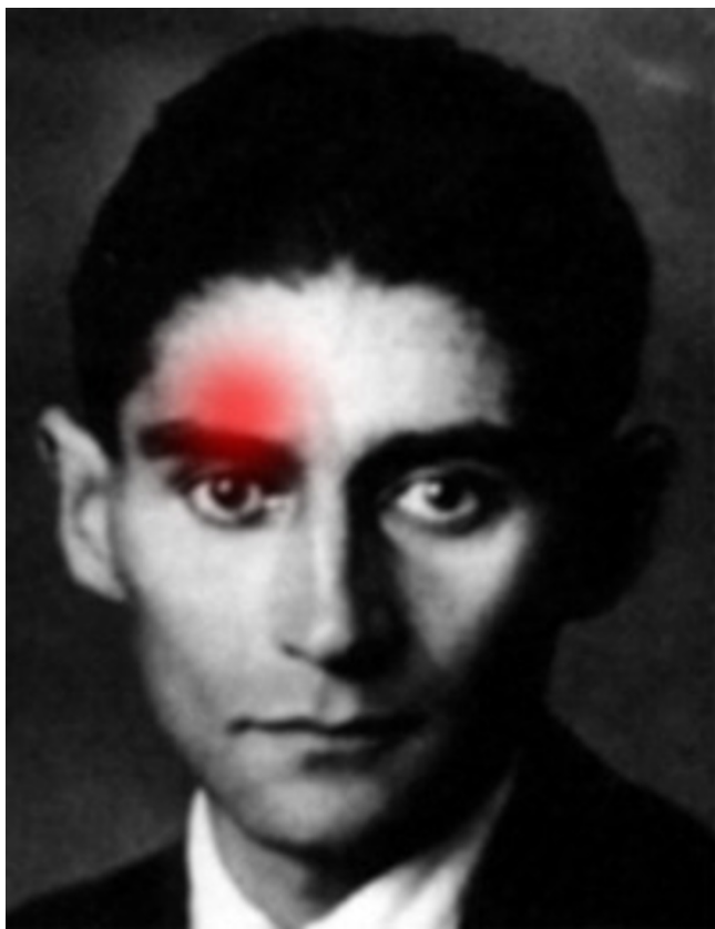
Figure 1 Pain in cluster headache. The location of intense pain, usually orbital or supraorbital, in a CH attack, overlaid onto the portrait of Franz Kafka (1924). Kafka suffered from extremely severe headache attacks, possibly CH [39].

these reports, vascular disorders (e.g. arterio-venous malformations [9,10], aneurysms [11], dissections [12], or fistulas [13] of the cranial vasculature) were associated with the onset of CH. In other patients, intracranial neoplasms (e.g. meningiomas [14], adenomas [15]) or local inflammatory processes [16,17] were seen in connection with the beginning of CH. All reports on putative secondary CH face the difficult question whether there is a causal relationship or a mere coincidence between CH and the preceding brain injury or disease. The International Classification of Headache Disorders suggests to code a headache with the characteristics of a primary headache (e.g. CH) as a secondary headache if it occurs for the first time and in close temporal relation to another disorder that is a known cause of headache [1]. We follow the phenomenologic classification of the International Headache Society (IHS) [18] and regard all headaches with the symptomatology of CH and developing in a close tempo-