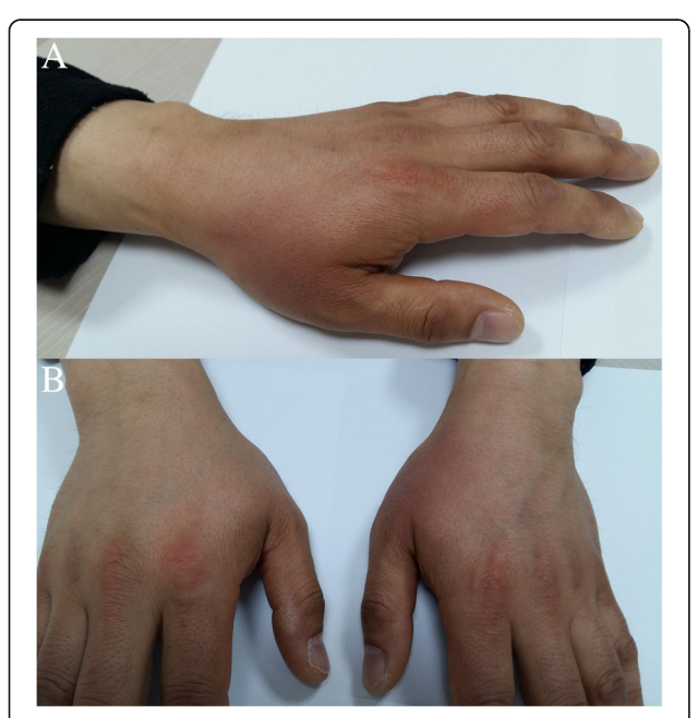
Fig. 1 Hands 4 days after onset. a Reddish skin observed at the lateral dorsum of the left hand between the thumb and index finger extending into the proximal phalanges of the 2nd finger dorsum. b Left hand shows a definite color change compared to the right hand

Research Council grade II). Finger abduction appeared weak, but strength improved when the hand was passively extended to the neutral position. Wrist and finger flexion was intact. On sensory examination, there was a well-demarcated area of hypoesthesia and a tingling sensation over the lateral dorsum of the left hand between the thumb and index finger extending into the proximal phalanges of the 2nd finger. In addition, reddish skin color and slight edema were observed in the same area (Fig. 1). There was no definite change in skin temperature and no pain. Reflexes were normal at the biceps and triceps brachii muscles, but the left brachioradialis reflex was absent. Routine blood analysis showed white blood cell count, C-reactive protein level and uric acid level were normal. According to the clinical information and neurologic examination, he was diagnosed with compressive radial neuropathy. After approximately two weeks of observation without specific treatment, the skin color recovered along with a marked improvement of the weakness and aberrant sensation. A nerve conduction study and electromyography were performed 2 weeks after the onset of the symptoms (Table 1). On the affected left side, a normal radial compound motor action potential (CMAP) was recorded over the extensor indicis proprius muscle with the forearm and elbow stimulated. When stimulated above the spiral groove, the CMAP was reduced by 34% compared to that of