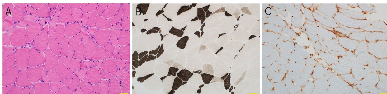
Fig. 2 Pathological findings. Hematoxylin–eosin staining (A). Adenosine triphosphatase staining (B). HLA-ABC immunohistochemical staining (C). Images were taken using an Olympus BX53 microscope equipped with 20 × objective lens and DP74 camera using Cell Sense software with a resolution of 0.46 μm/pixel. Any adjustments were applied to the entire image. Threshold manipulation, expansion or contraction of signal ranges, and altering of high signals were not performed. The scale bar length is 50 μm. HLA-ABC: Human leukocyte antigen-ABC

[11, 12]. Type 2 fiber atrophy occurs in various conditions, such as sarcopenia, aging, steroid myopathy, and central nervous system disorders, and is not associated with specific diseases [19]. In the present case, the muscle pathology of biopsy suggested moderate type 2 fiber atrophy, and a very mild process of muscle fiber necrosis and regeneration with type 2c fibers, which indicate regenerating or fetal muscle fibers between denervation and reinnervation processes in the background [20]. However, fiber-type grouping, which suggests a reinnervation process in regenerating muscles, was not apparent. Therefore, the presence of type 2c fibers might indicate rhabdomyolysis or a very acute phase of denervation.