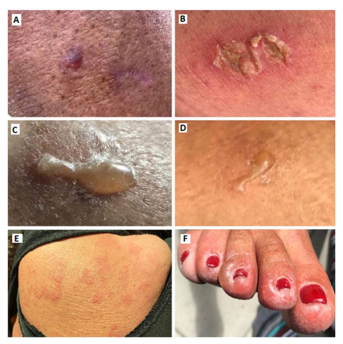
Fig. 3 Skin manifestations. A-F. Skin manifestations with rashes and blisters on the trunk, proximal and distal extremities

Nandy et al. BMC Neurology (2023) 23:233 Page 6 of 8