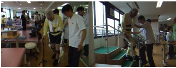
Figure 1 A stroke patient using the hybrid assistive limb (HAL) suit. The left image shows a patient using the HAL suit and walking with a cane, and a physiotherapist pays attention to the patient while noting his fall. In the right image, the patient is being trained to climb down stairs by a physiotherapist.

increase and assist the voluntary motor function of the body and is used to provide walking support for people who require nursing care, including the elderly with muscle weakness and people with impaired motor function [4,5].