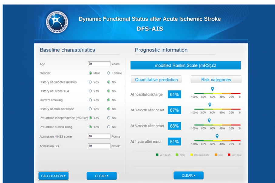
Figure 1 The web-based calculator for the DFS-AIS.