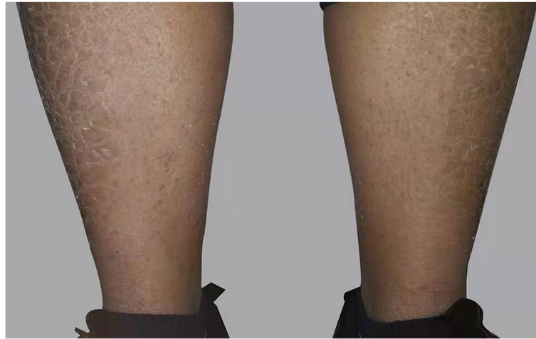
Fig. 1 The skin on the patient's shins was dry and scaly

revealed punctate areas of restricted diffusion in the left corona radiata that represented small acute infarct (Fig. 2a). Magnetic resonance angiography revealed no significant flow-limiting stenosis. Because the MRI-detected lesions were ipsilateral to the paralyzed limb, the patient underwent diffusion tensor imaging (DTI) (Siemens Magnetom trioatim 3.0 T, Siemens Leonardo) tractography, which revealed uncrossed corticospinal tracts (Fig. 2b). The level of D-dimer was within the normal range in our patient who without history of hypertensive disease, in addition, no abnormalities were found in carotid ultrasound, cervical MRI, echocardiography, foaming test and microembolism monitoring, the probabilities of arterial dissection or patent foramen ovale were reduced.